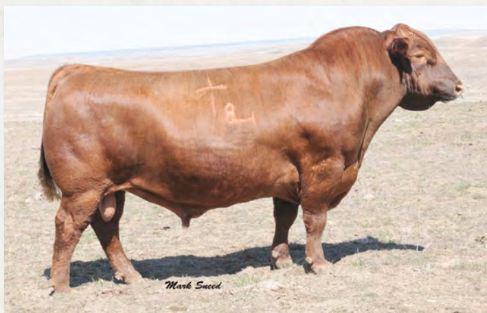
Beckton Epic R397 K, sire of Lot 103

Nexa 845 is backed up by a highly maternal background with MPPAs ranging from 101 to 108 clear back to a 1979-born dam. Her calves post an average WR of 101 and an average YR of 102. She has eight numbers in the top 23% of the breed or higher with just an overall very strong, stable EPD profile. You can't beat the proven performance here.