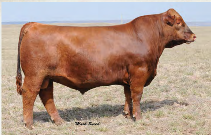
C-T Grand Statement 1025, sire