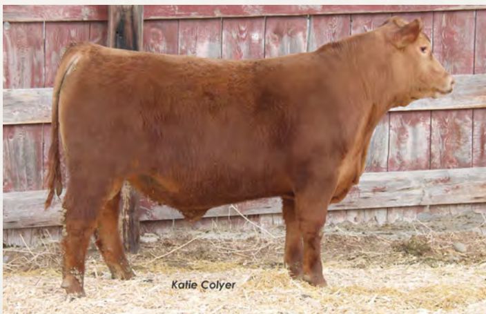
C-T Exceptional 5015