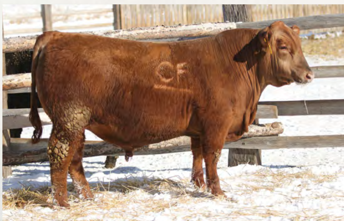
Feddes Maggio 806-E303, service sire

E84 boasts a HB 15%, GM 29%, Milk 23%, HPG 4%, CEM 29%, ST 24%, Marb, CW and REA all in the top 14%. The Silver Bow cattle just plain get it done. A couple of the heaviest bulls in our 2019 sale pen are Silver Bow sons. This is an exciting mating with Defender 30Z.