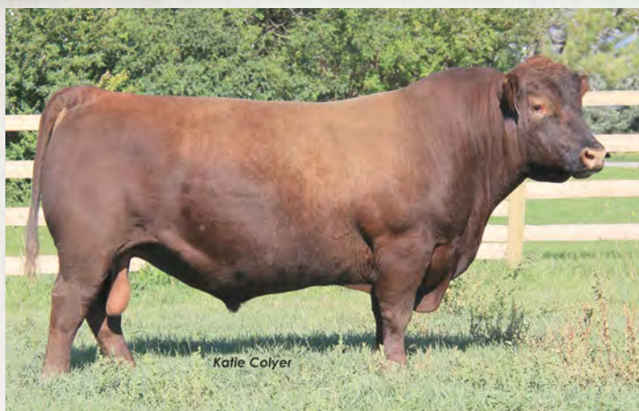
Feddes Montana X44, maternal brother to Lot 138