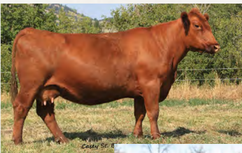
Lot 28, GMRA Larkoba 517, donor

Here is your chance to take home an embryo package from the dam of GMRA Trilogy 0226!