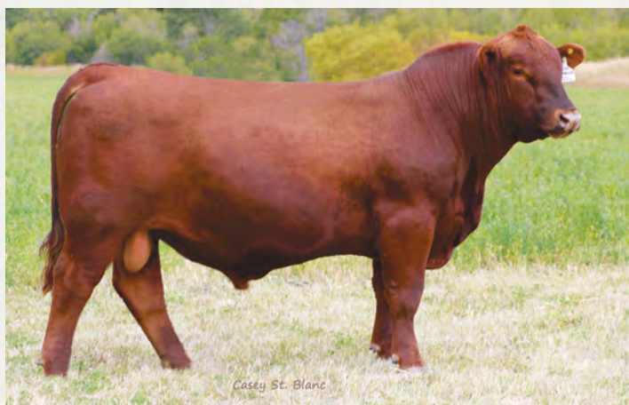
HXC Declaration 5504C, service sire

Nexa 637 produced a nice, solid, first calf that ratioed 101 and will go into the bull sale. She has a super-solid set of numbers with 13 EPDs in the top half of the breed on up to single-digit percentiles. GMRA will pay for parentage testing.