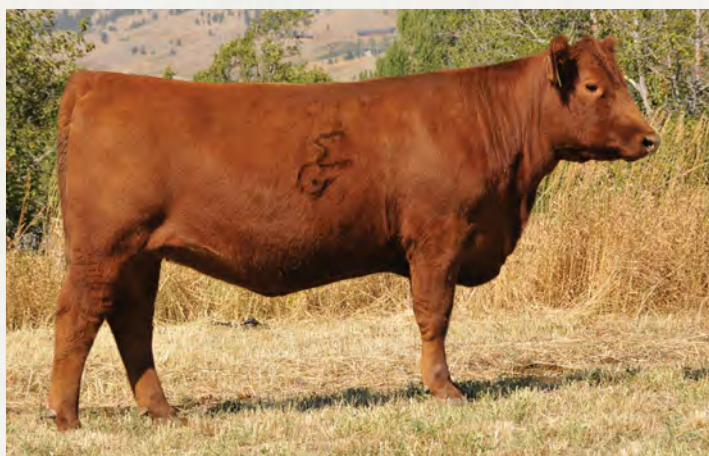
LGR Venice 103, daughter of Lot 94