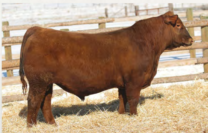
Feddes Indy C18-E262, service sire

E78 is a Redemption daughter from the Blockana cow family. She has 14 traits in the top 38% of the breed. That is the balance that we are looking for.