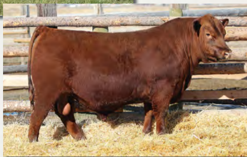
Lot 29, Feddes Brunswick D202, sire