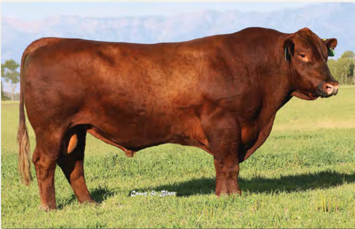
GMRA Stetson 2240, sire