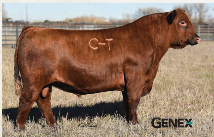
C-T Red Rock 5033

A moderate-framed Prime daughter from the maternal Tina cow family. These Tina cows have been big producers with great calving ease. 7123 is in the top 20% HB, 2% CEM, 8% Marb. Don't miss this cross with the great calving-ease bull, C-T Red Rock 5033, standing at Genex!