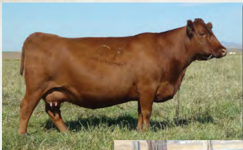
Lot 29, Feddes Lakina X113, donor