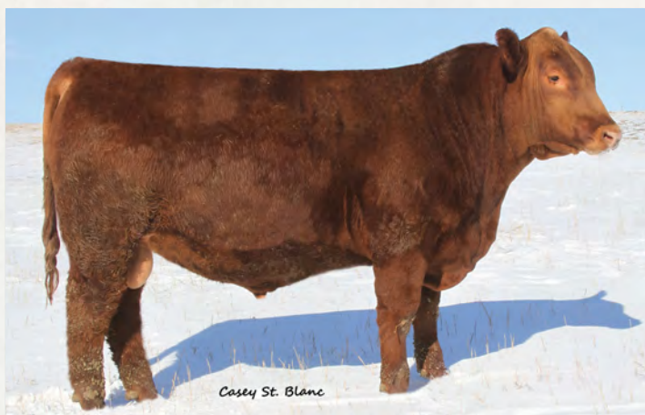
GMRA Justice 3266, son of Lot 20

We just love the Make It Easy daughters in the herd and Juana 219 is a prime example of why we do. She posts an MPPA of 103 with an average WR and YR of 104. She is following in a long line of performance-minded females that feature MPPAs over 100 generationally, going back to 1993. She combines performance with a very consistent set of numbers featuring growth and carcass in the top one-third of the breed or higher.