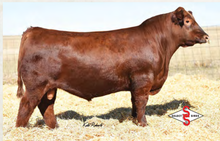
GMRA Tesla 6214, reference sire