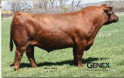
Lot 26, 3SCC Domain A163, sire