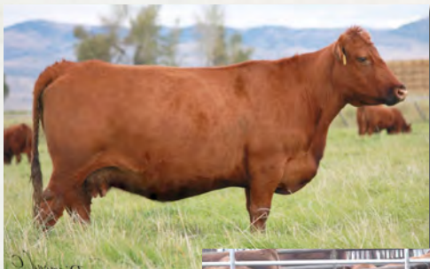
Lot 30, Feddes Sleek 806, donor