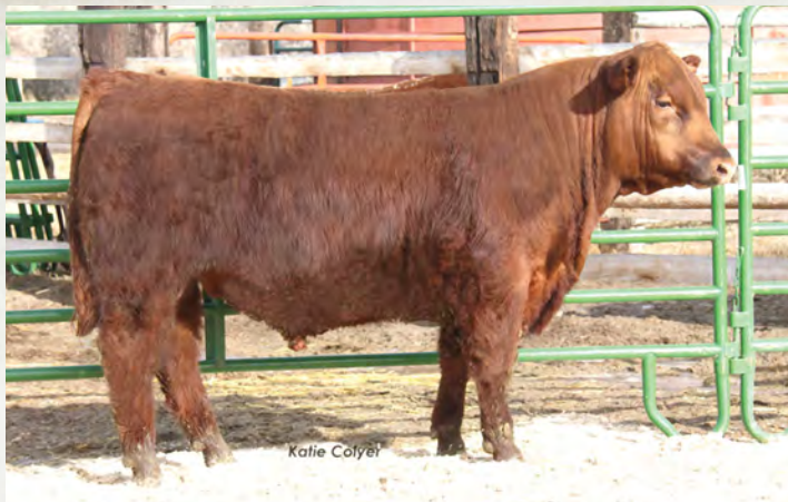
Feddes Red Pack Y84 B217, sire of Lot 78