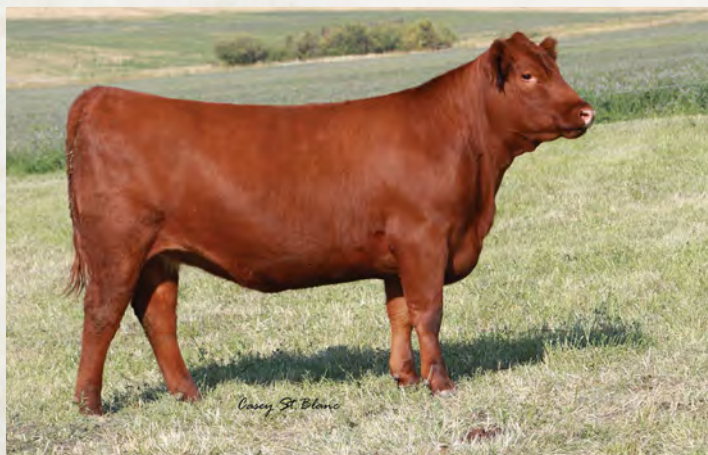
GMRA Firefly 609, daughter of Lot 92

This young Sleek cow has a daughter in our replacements, and a son in the bull pen for our spring bull sale. Her dam has spent some time in our donor pen. C69 has 14 EPDs in the top 36% of the breed. That is the kind of balance we seek to produce. If she was bred earlier, she would certainly stay in our herd.