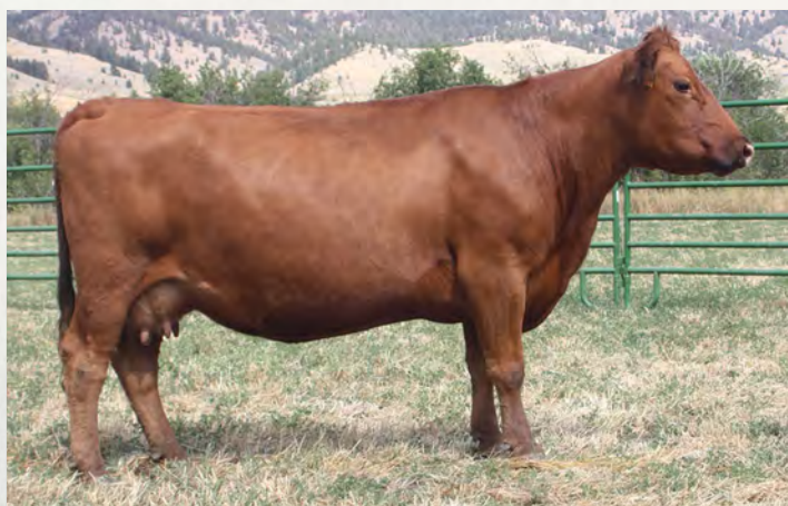
GMRA Venice 664, dam of Lot 101

This Epic daughter has 11 traits in the top 27%. She has one daughter in our herd and another in our replacement pen. MPPA 100.6. Lincoln is a well-balanced X28 son out of a powerful Conquest by Blockana cow.