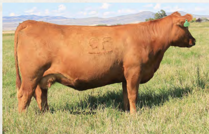
Feddes Blockana Z79