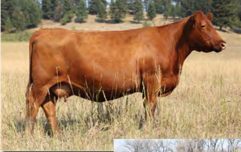
Lot 26, DKK Starlette 07, donor