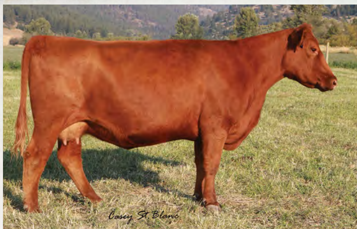
Casey St. Blanc GMRA Venice 950, dam of Lot 93