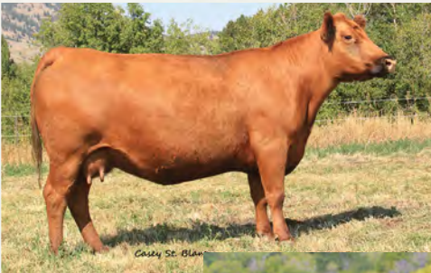
Lot 27, GMRA Lakota 625, donor

Let us introduce you to DKK Starlette 07. She has LOADS of capacity, fertility, extra femininity, perfect feet, a perfect udder, an excellent disposition and a stunning presence. Coupled with the breed-leading 3SCC Domain A163, this is most definitely a planned mating to behold! Top 1% HB, 2% Stay, 3% GM, 4% HPG, 10% ADG, CW and REA; 15% CED, 20% YW and 30% WW. Starlette 07 is the dam of the up-and-coming young sire; DKK Captain Incredible 6042. Selling three embryos with a guarantee of one pregnancy if implanted by a certified embryo technician.