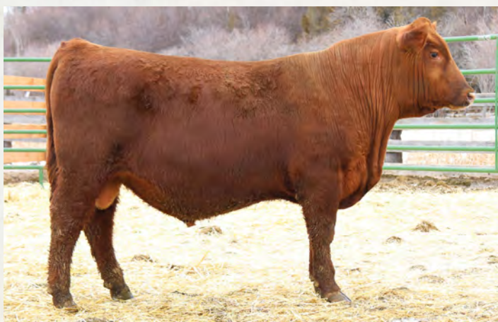
GMRA Greely 7207, son of Lot 24

This moderate, clean-fronted Redemption daughter has a daughter in our herd. Her 2017 son sold to Kenny Pfeifer, MT, and her 2018 bull calf is in the bull pen for Feddes/C-T Bull Sale in March 2019. She has eight traits in the top 25% of the breed, including MARB in the top 5%.