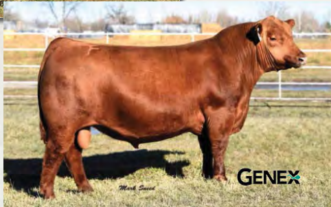
Lot 27, H2R Profitbuilder B403, sire