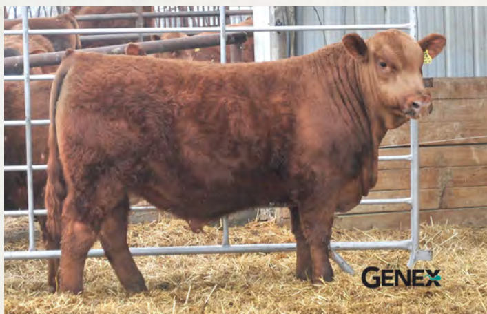
Leland Marksman 6629, service sire