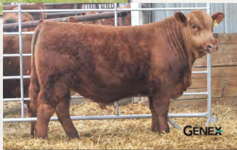
Lot 30, Leland Marksman 6629, sire