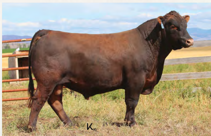
PIE One Of A Kind 510