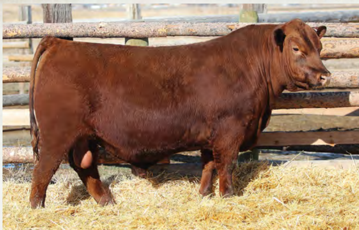
Feddes Brunswick D202, service sire