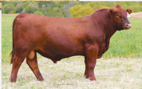
Lot 27, HXC Declaration 5504C, sire